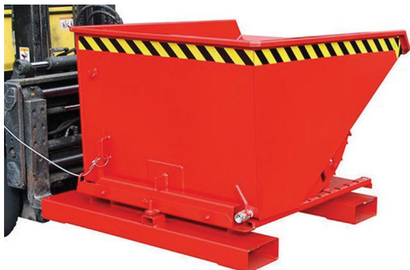
High strength construction with 2 skip volumes available