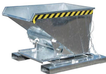
6 finishes available including Hot Dipped Galvanised